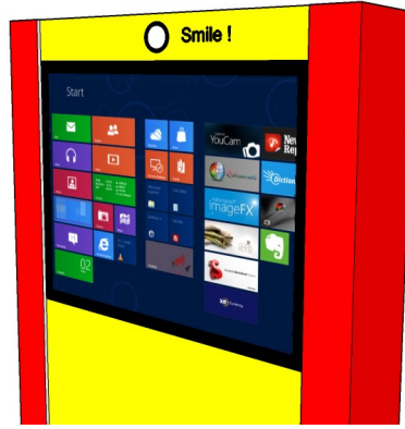
Fast touch screen