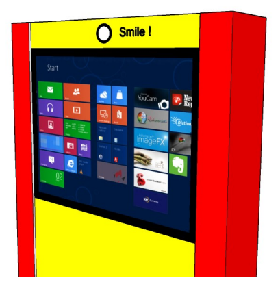
HD resolution camera